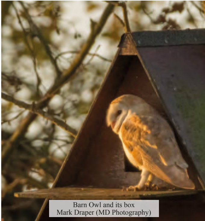
Barn Owl and its box

By the time you read this, birds will be nesting, and other creatures will be out of hibernation. The Biodiversity Group and other volunteers have been very busy over the winter making and putting up bird and owl boxes in the Country Park and along the Railway Walk.