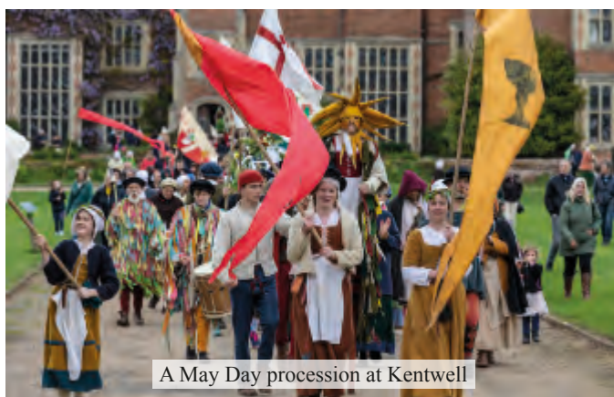
A May Day procession at Kentwell

For details see www.kentwell.co.uk/events