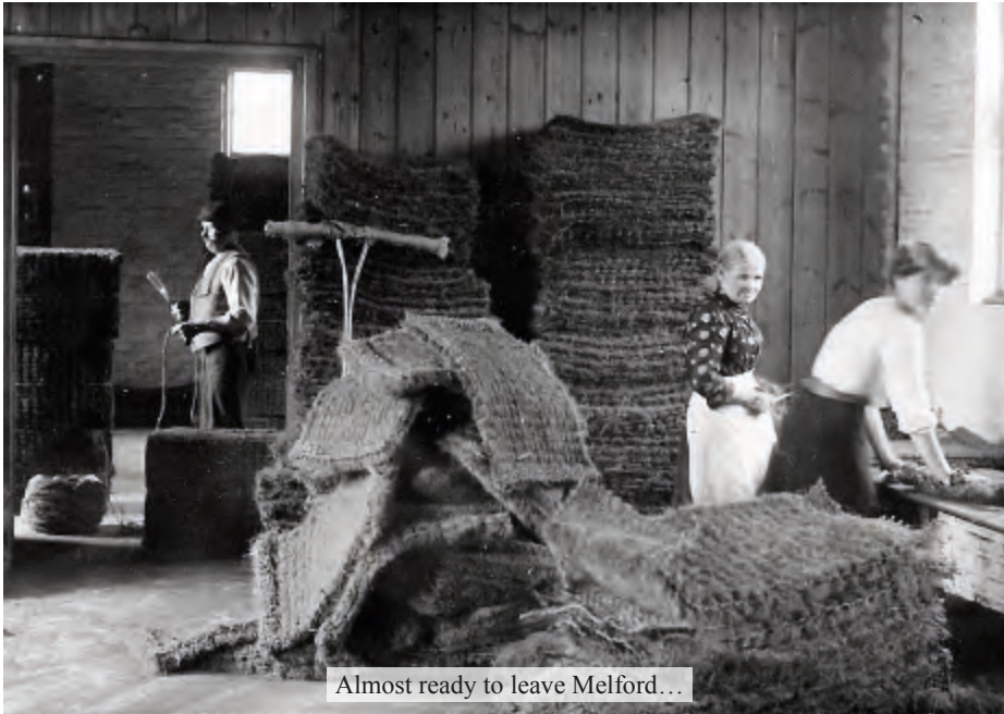
Almost ready to leave Melford...

The mats were sent mainly to retailers in London. However, some were sold in distant parts of the world such as Russia and Argentina.