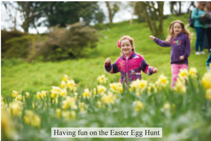
Having fun on the Easter Egg Hunt

Melford Hall reopens on 6th April. Join us to enjoy the tranquil gardens and the daffodils, irises, and crocuses that can be spotted in the grounds. The newly regenerated Mirror Pond is the perfect spot to relax, watch the reflections and look for newts. Step into the Hall to discover its history and the stories of the people who shaped it.