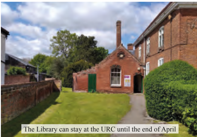
The Library can stay at the URC until the end of April

We were due to move to the Royal British Legion on Cordell Road in March but you may be aware there has been an issue affecting the RBL which has prevented our move. At the time of writing, the outlook is still uncertain but we're exploring our options and have been granted a further 4 weeks to remain at the URC until the end of April. We've been very grateful for your support. Please visit our website or Facebook page for the latest news. We'll keep you updated and are looking forward to welcoming you to our new location!