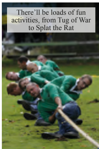
There'll be loads of fun activities, from Tug of War to Splat the Rat

There will be loads of attractions. We'll need some strong, hefty men to form teams for the Tug of War. And are there any women who'd like to form a team? Do you have a dog with star quality? The one with the waggiest tail? The one which looks most like its owner? Might he/she be a Dog Show prize winner?