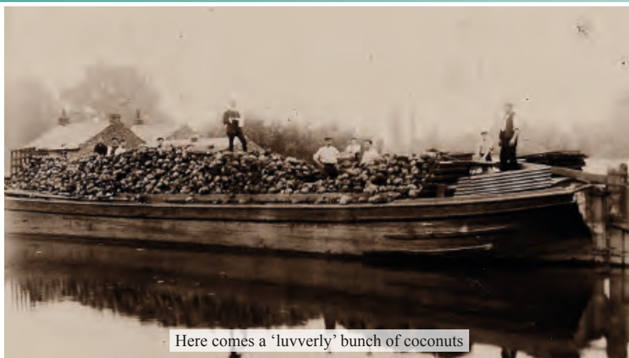
Here comes a 'lurveverly' bunch of coconuts