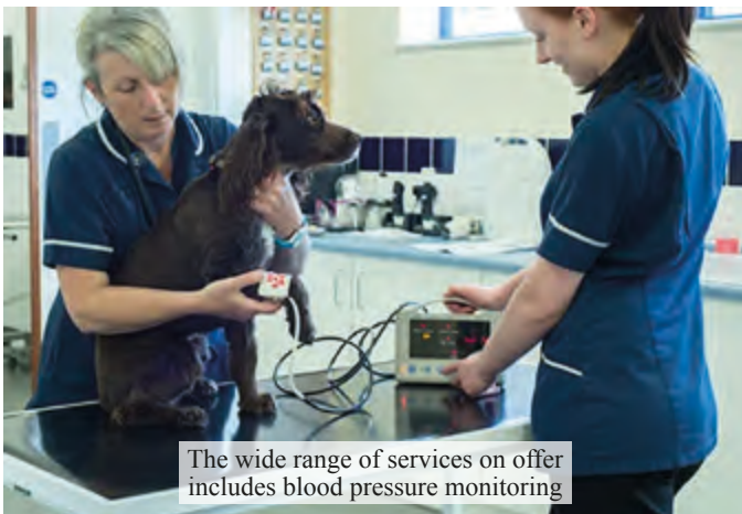
The wide range of services on offer includes blood pressure monitoring

The best thing about being a vet is the variety. There's also an enormous amount of satisfaction in looking after a sick or injured animal and making it better. I consider it a privilege to serve the pet-owning community of Long Melford – all of our clients are lovely.”