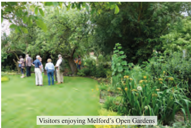
Visitors enjoying Melford's Open Gardens

We're pleased to announce that Long Melford Open Gardens is back on Sunday 29th May 2022 10am-4pm. Tickets will be £6 per adult and free for children. You can buy them from Breakout, Budgens, Carter Jonas, Dilly Dally and Jessica Muir Gallery during the lead up to the event and on the day from the gardens themselves. A ticket entitles you to entry to all of the private gardens listed on the map and the gardens at the Church and Melford Hall.