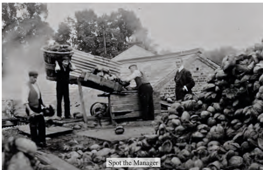
Spot the Manager