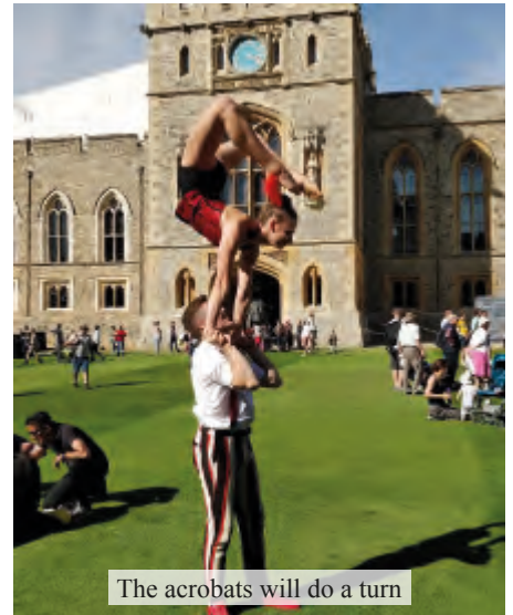
The acrobats will do a turn