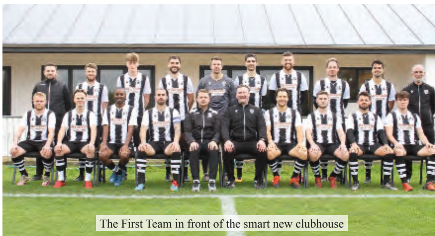
The First Team in front of the smart new clubhouse